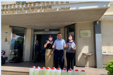
Caring for the Neighborhood