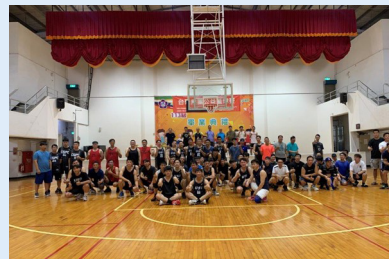
USIG Charity Basketball Competition