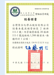
Completion of the Forestation Adoption Program Phase IV Donation