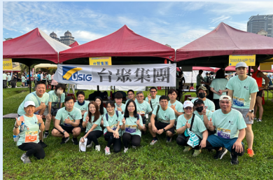
Responded to the 2024 Taipei Tech Cup Charity Road Run