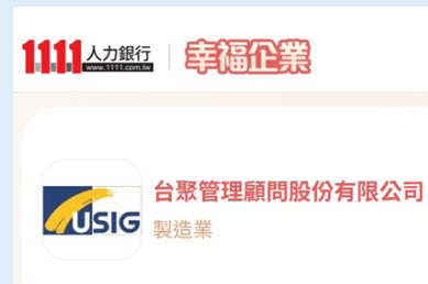
Selected as a Happy Enterprise in 2024