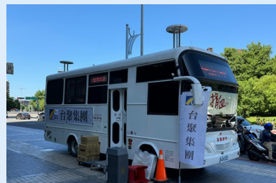
Responded to the Neihsu Science and Technology Park Thousand Blood Donation Campaign