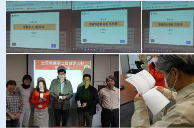
Results Presentation of USIG 2nd “Walking Activity”