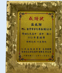
Sponsorship of books and miscellaneous expenses for students in Renwu District