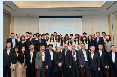
2024 USI Education Foundation Scholarship Awards Dinner