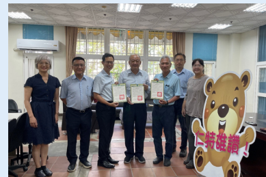
Adoption of air quality purification area